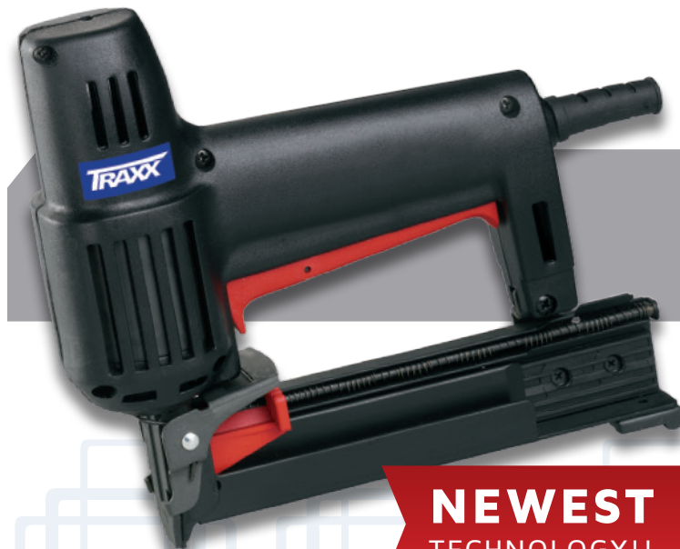
Part No. TTX-PP5418

Engineered with a fiberglass-impregnated composite housing, the TRAXX 5418 brings you tremendous impact resistance. And, its bumper design dissipates recoil when driving staples for total user comfort.