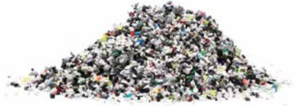
RECYCLED EVA FOAM