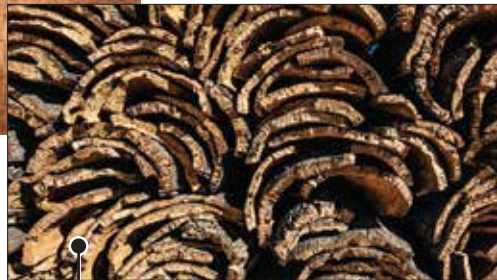
CORK REMOVED FROM TREES