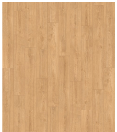
DOCKSIDE 63338 VARIATION: LIGHT

Color may vary between actual product and printed images. Always make your selection from an actual product sample.