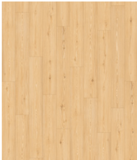
BROOKESWOOD 63342 VARIATION: LIGHT