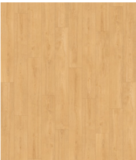
STERLING 63336 VARIATION: LIGHT