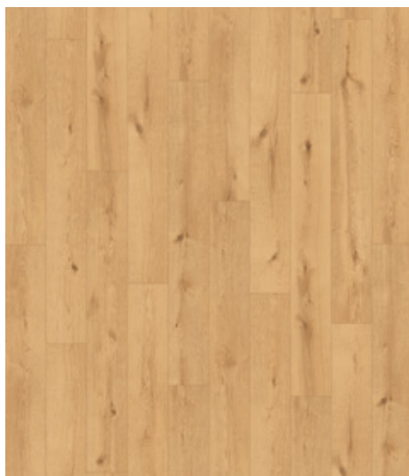
HOLLYBURN 63339 VARIATION: LIGHT