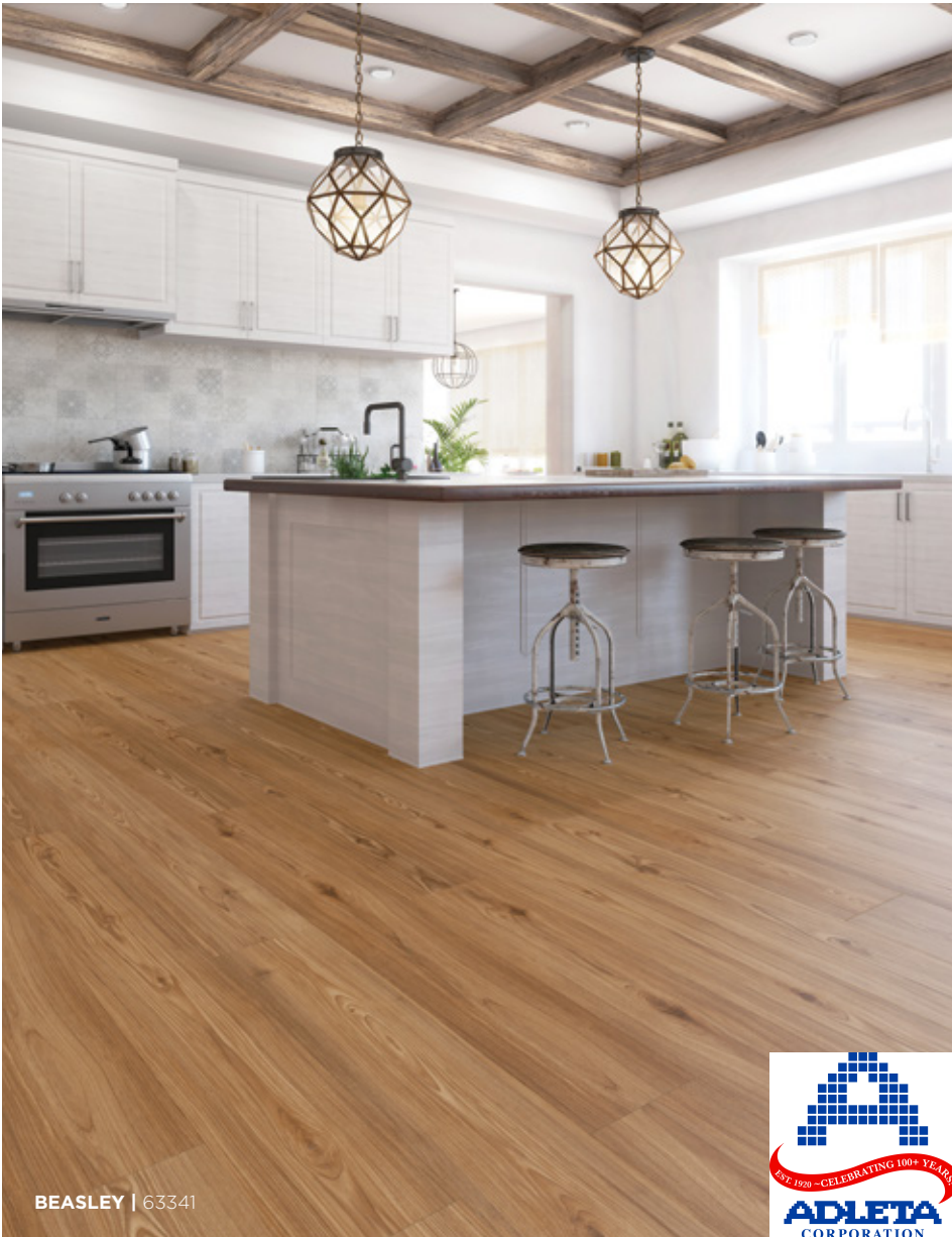
BEASLEY | 63341