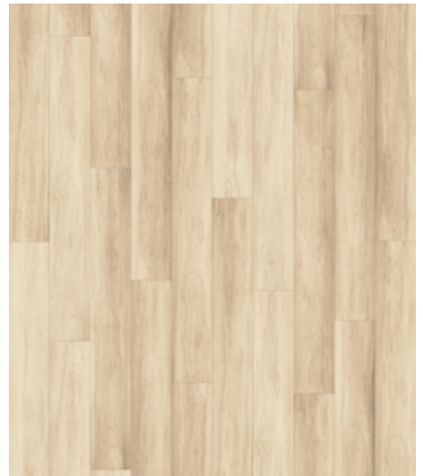
CLOVERLEY 63345 VARIATION: MEDIUM