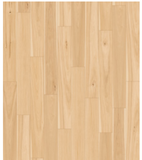
SALTSPRING 64233 VARIATION: MEDIUM