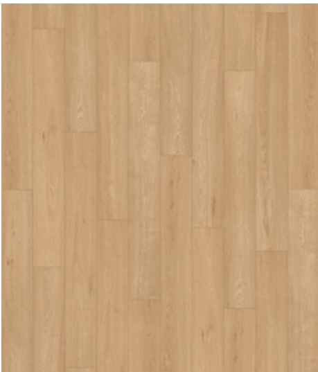
LANSDOWNE 63337 VARIATION: MEDIUM